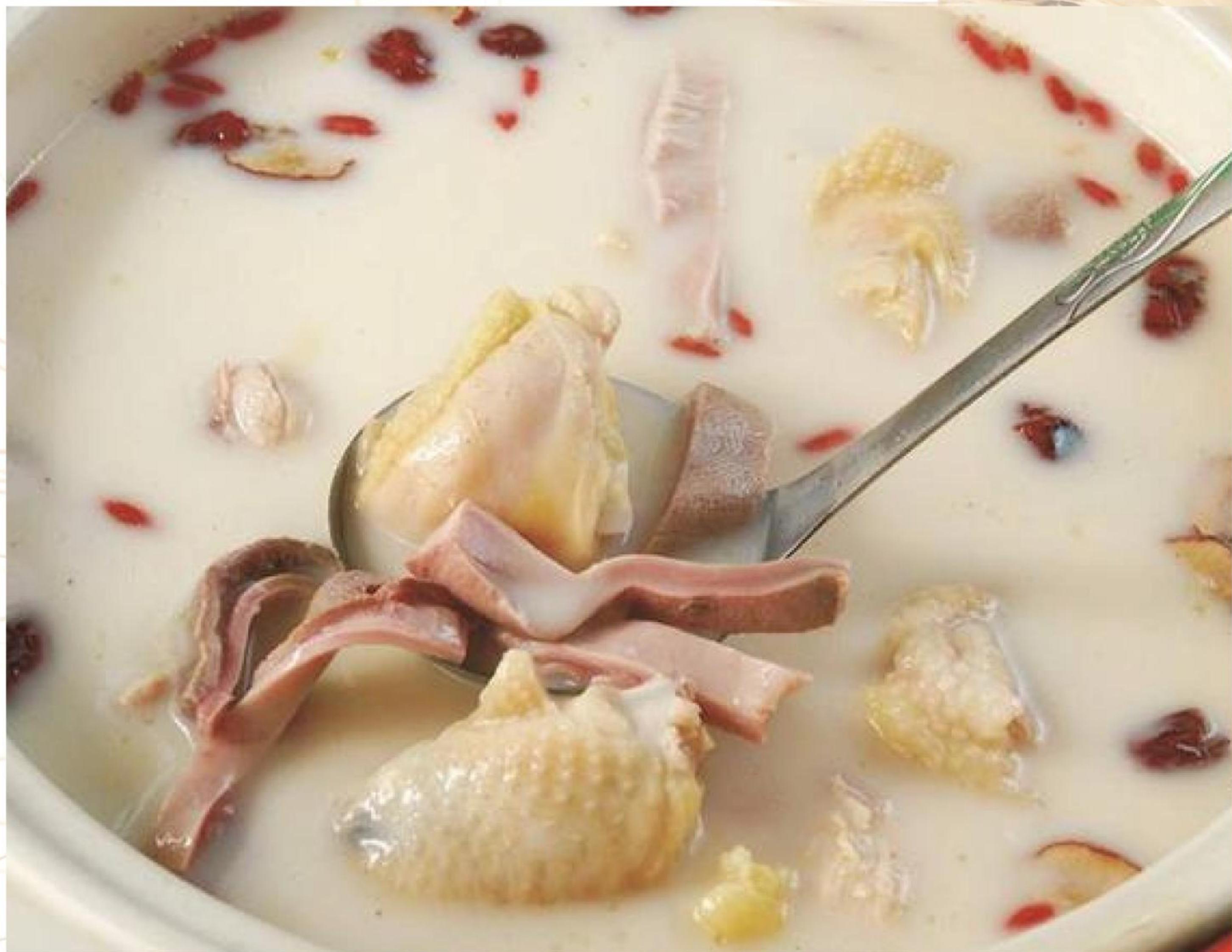
C63 猪肚鸡 Pork Stomach and Chicken £18.80