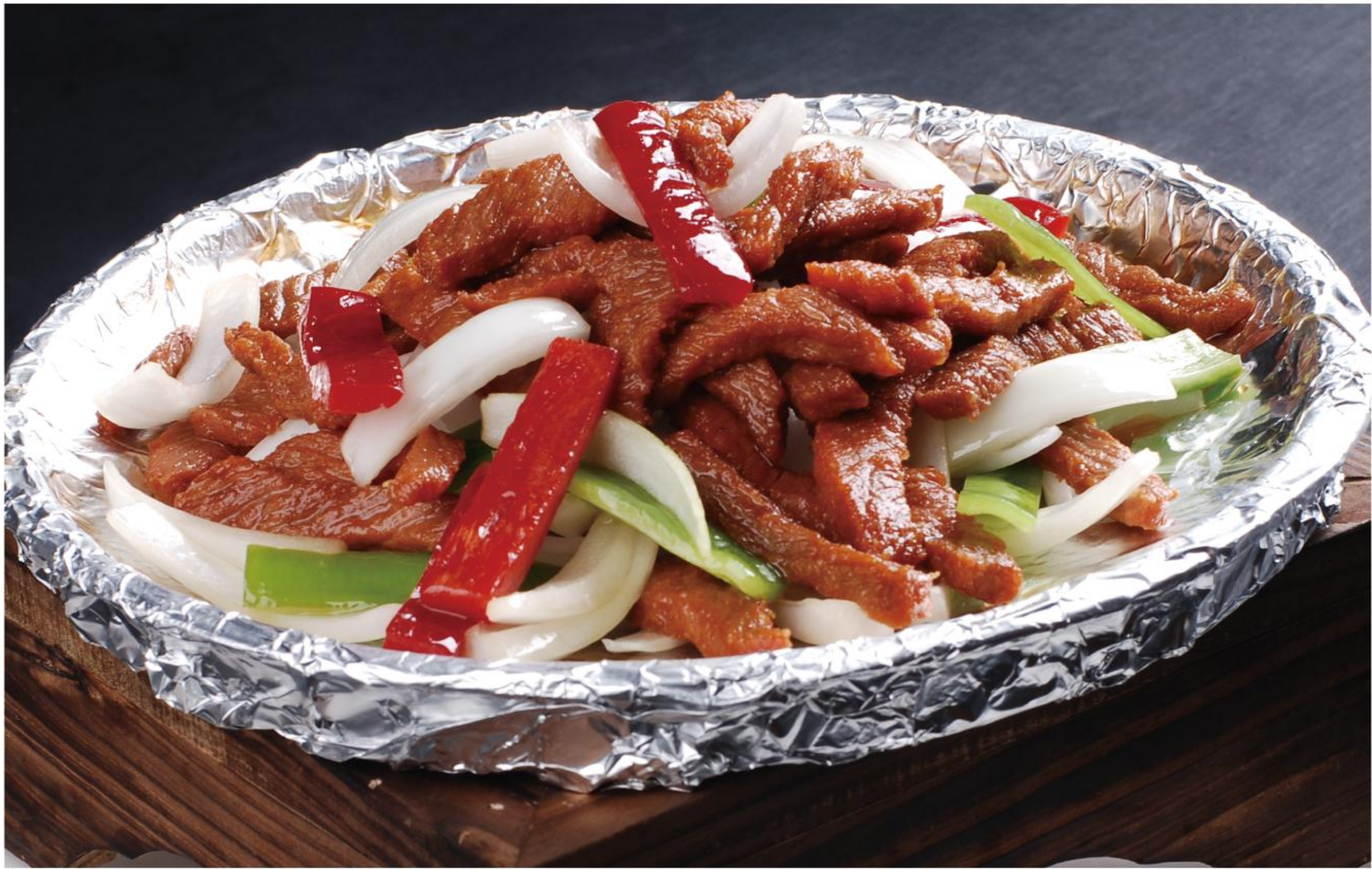
C40A 铁板黑椒牛 🌶️🌶️🌶️ Sizzling Beef with Black Pepper £15.80