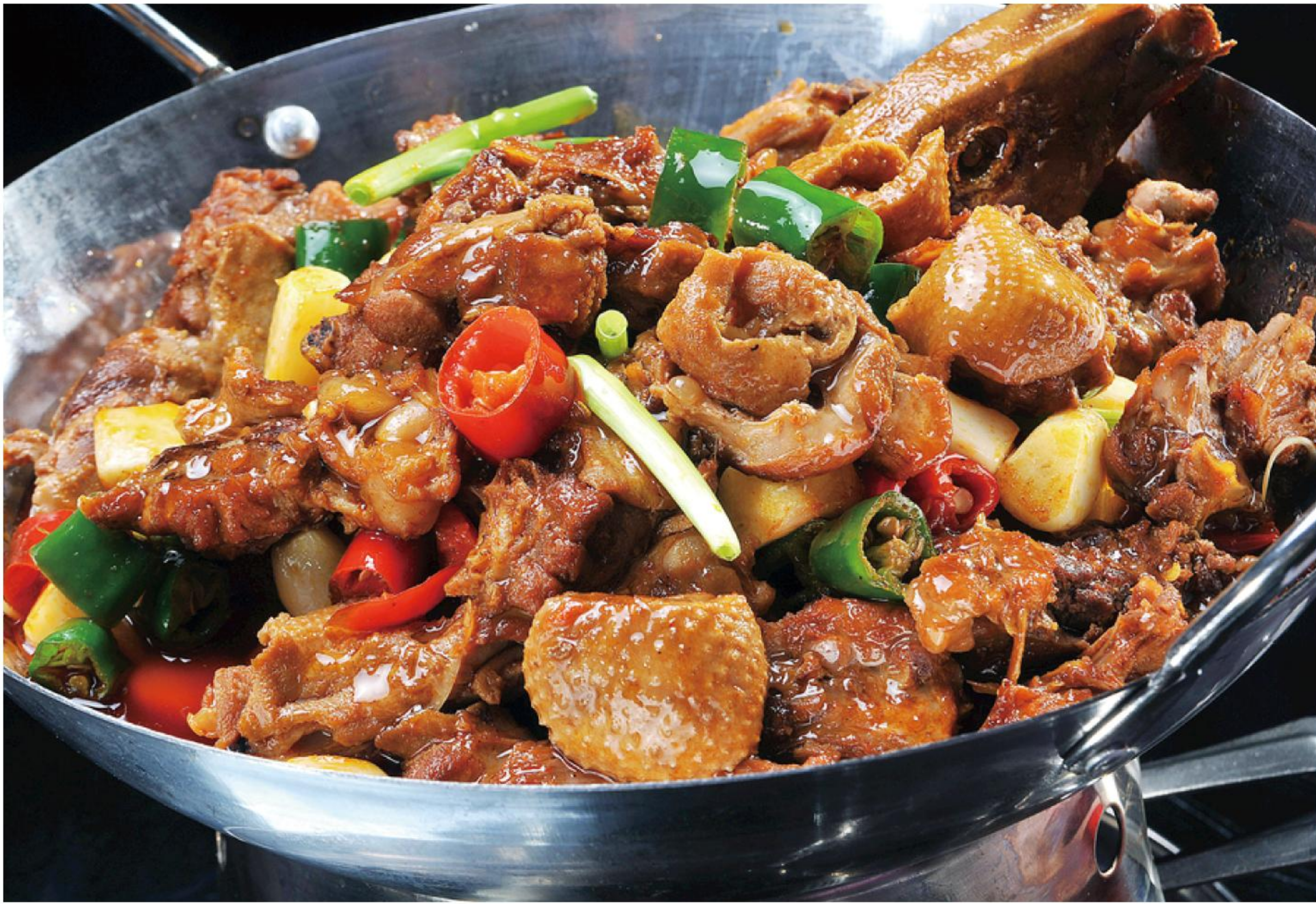
C41 干锅鸡块 🌶️🌶️🌶️ Spicy Drypot Chicken £12.80