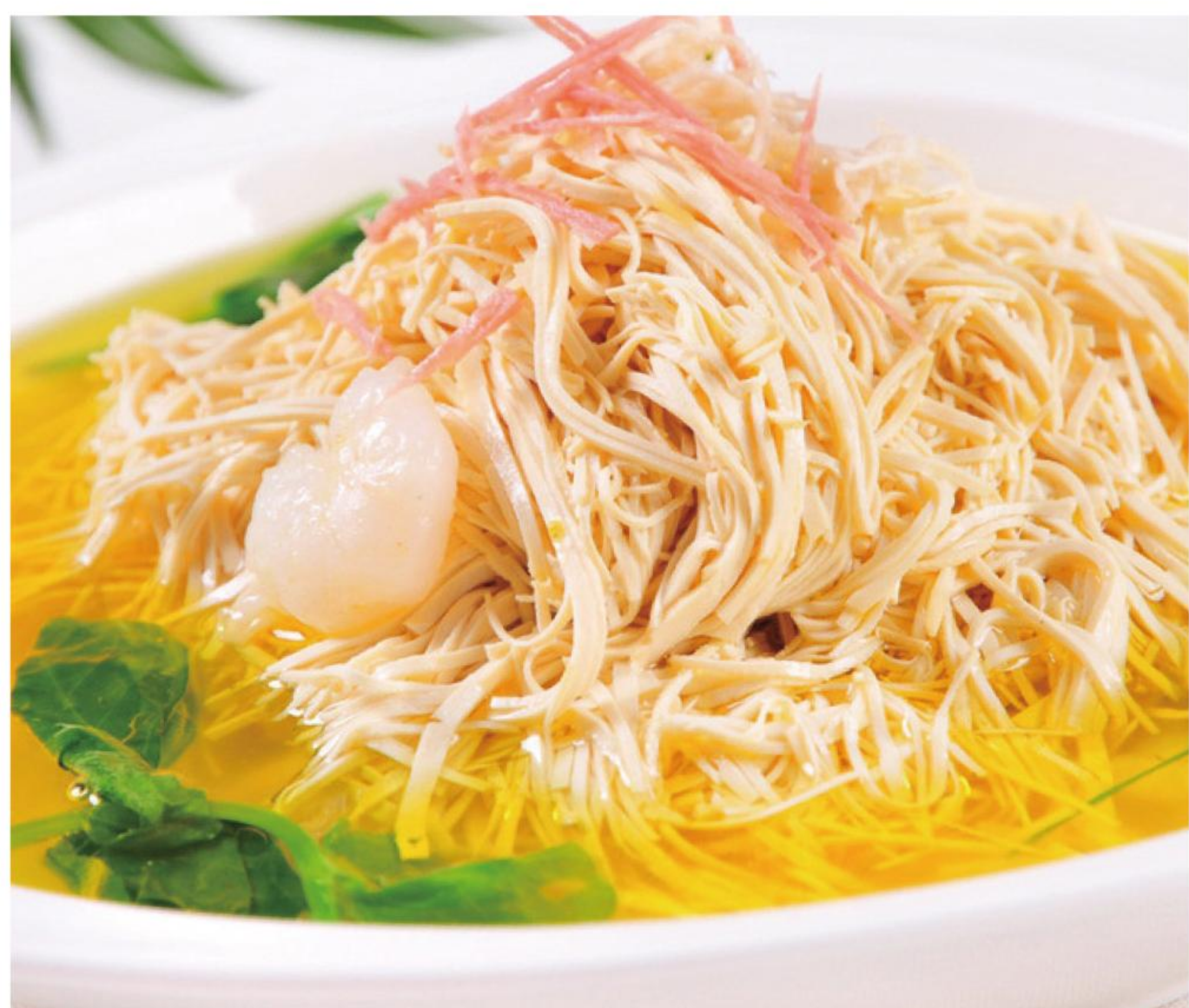
C16 大煮干丝 £14.80 Braised Shredded Chicken with Ham and Dried Tofu